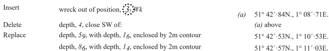
Chart 5607_3 [ previous update 2230/24 ] ETRS89 DATUM