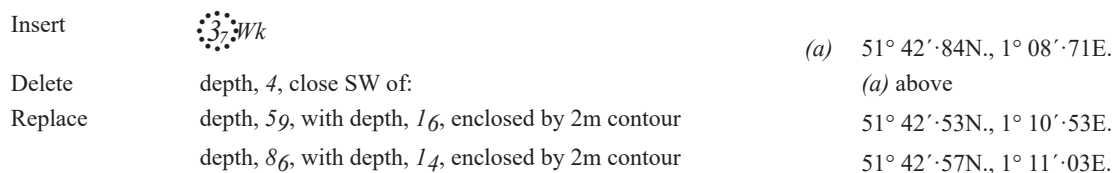
Chart 5607_2 [ previous update 3240/24 ] ETRS89 DATUM